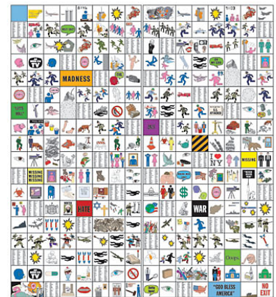
(L-R) Front Pages: November 17, 1996, 1996; Chicken Little and the Culture of Fear: Scene 1, The Garden , 2004; (Top) Enron , 2002; 9/11 , 2002-04