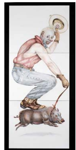
L-R: Babeboyman , 2007; War Heads , 2007; Boarboy , 2006 Top: Face Plant , 2007