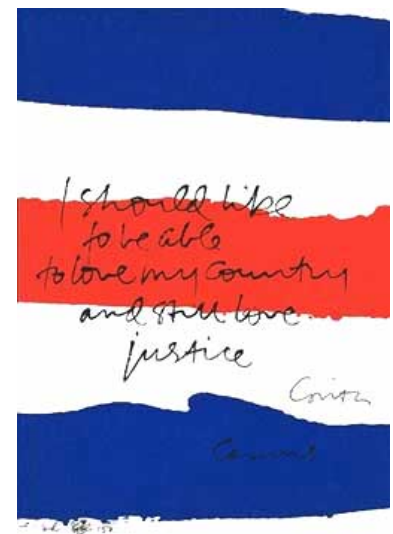
Top page: Klaus Staeck, Wir Rufen die Jugend der Welt [We call to the Youth of the World] , 1988