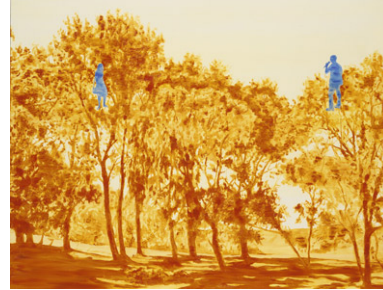
Above, left to right: Palabra contra muro , 2005; Finger , 2005; Bosque , 2005