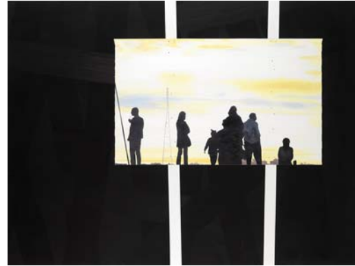
Pantalla , 2005

Lectures: Spot Compositions: Works 2001-2006 , Tuesday, October 17, 10am and Thursday, October 19, 7:30pm, Otis Forum, Ahmanson Building.