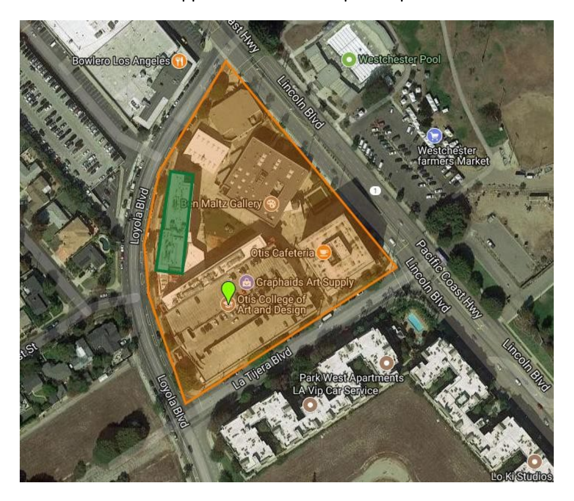
Appendix A: Main Campus Map