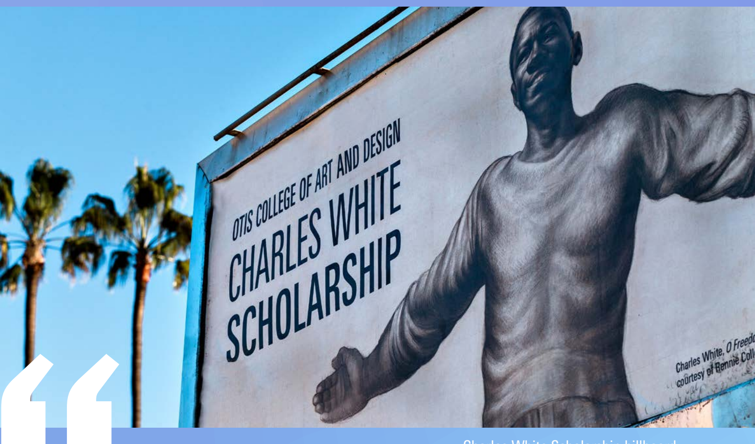
Charles White Scholarship billboard

The Charles White Art and Design Scholarship is an important step taken by Otis College to say that not only are we creating a space for BIPOC students to explore their passion, but we are providing the financial support for them to thrive. The hope is that this scholarship helps aspiring BIPOC artists and designers to see themselves in Charles White and be inspired to create their own path.