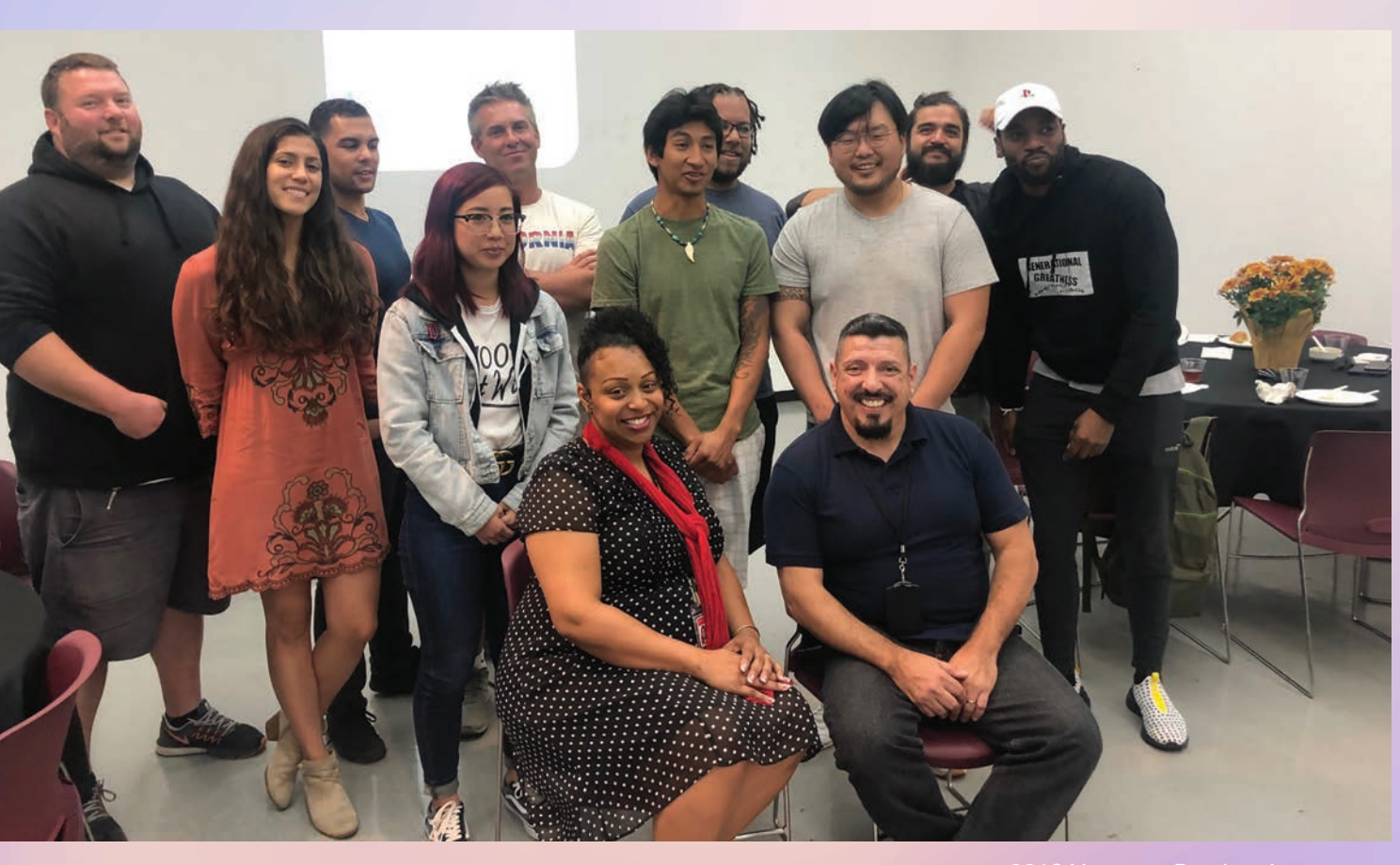
2019 Veterans Day luncheon even