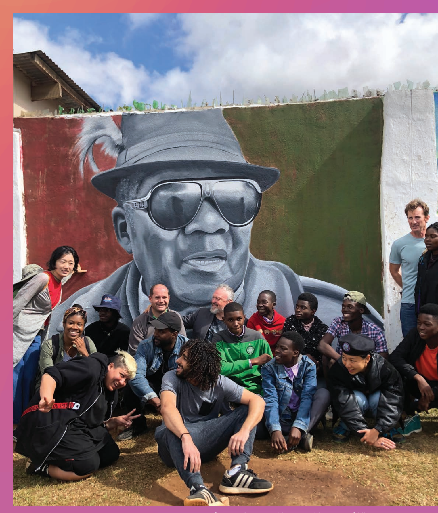
Creative Action and Integrated Learning (CAIL) course