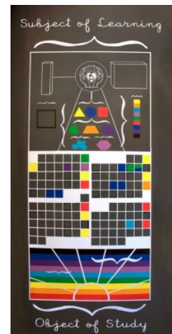
Top: C'mon Language , 2013 (Portland Museum for Contemporary Art); Schema for K , 2015 (REDCAT Los Angeles). Bottom: Subject of Learning / Object of Study , 2010 (Blanton Museum of Art).