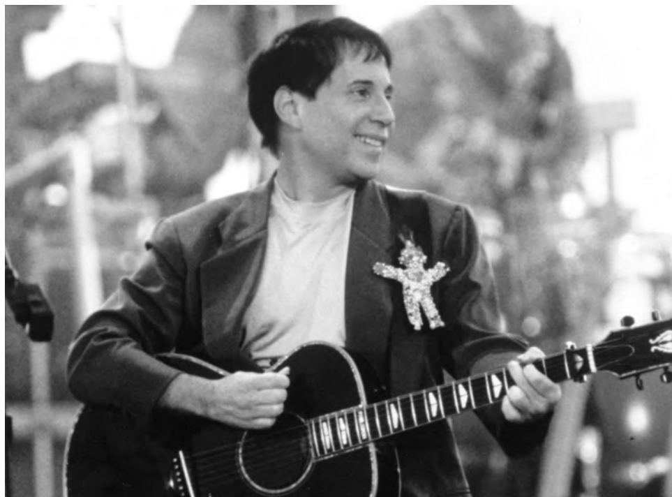
Photo credit: Paul Simon's Concert in the Park, 1991.

Otis College of Art and Design partners with a fellow arts organization to provide its outstanding Continuing Education courses throughout the community.